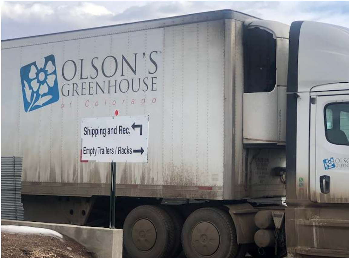
Tri-State added this wholesale greenhouse near Fort Lupton and two other non-electric members in order to lose its exemption from regulation by the Federal Energy Regulatory Commission.

An administrative law judge with the Colorado Public Utilities Commission in August 2020 concluded that an exit fee of $235 million would be just and reasonable.