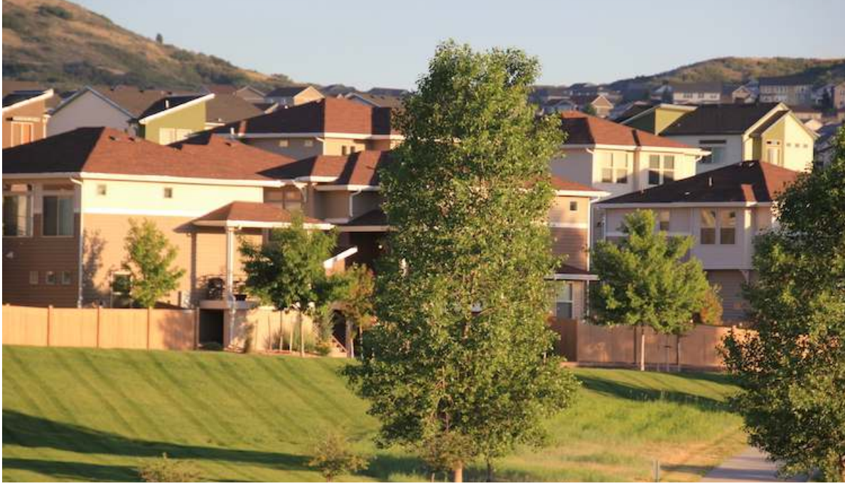
Castle Rock has become a poster child for the need to crimp outdoor irrigation. It depends upon unsustainable drafting of the Denver Basin aquifers, has almost no river drainage above it (Plum Creek), and has no access to imported Colorado River water.

At the same time, he also noted that municipal outdoor use is a comparatively small part of total water demand in Colorado. “Both sectors, ag and urban, should contribute as proportionally as possible to any further required demand reductions.”