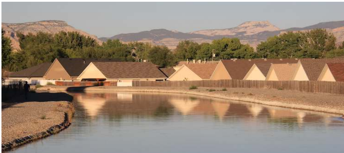
An irrigation canal in Grand Junction.

“When you rip up turf, what do you replace it with ? How do you fix the irrigation after that change? There are rates and codes and other regulations that drive these changes.”