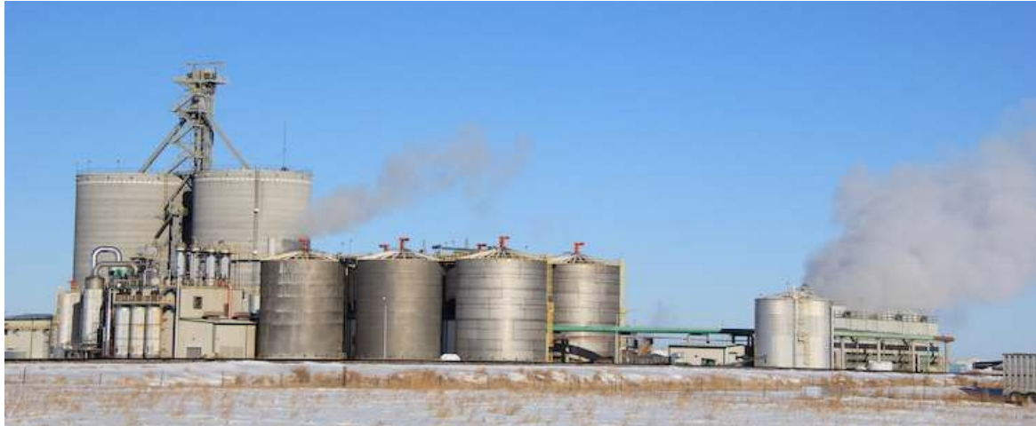
An ethanol plant at Yuma is among the candidates for deployment of carbon capture and sequestration technology.

costs down and allow deployment at scale in a number of sectors. Important technologies may include green hydrogen, long duration energy storage, carbon capture and storage, advanced biofuels, and synthetic fuels based on air capture of carbon.”